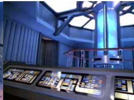
Top Row: USS Trailblazer dedication plaque, Transporter room, Typical corridor; Second Row: Armory, Crew Messhall, Sickbay biobed, Engine room; Right: Standard officer's quarters.